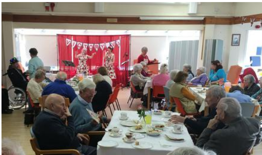
Friends Social Day Centre Tea Party