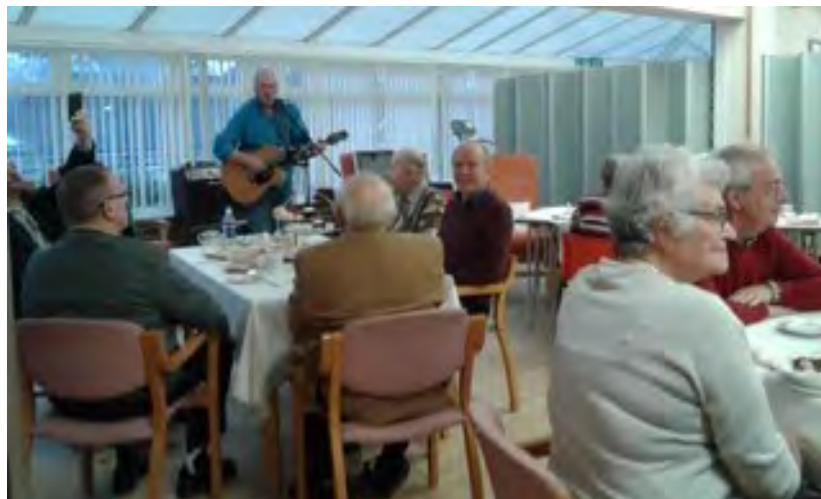
Social Day Service tea party